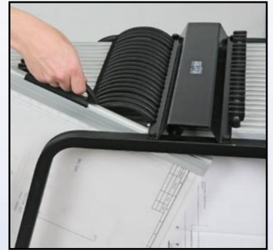
Easy Front Loading Access